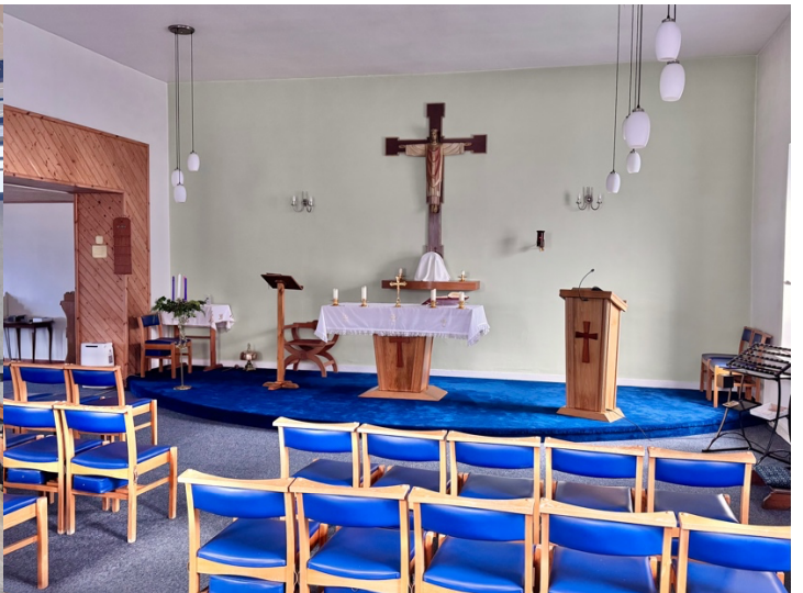
Holy Cross, Aberaeron.