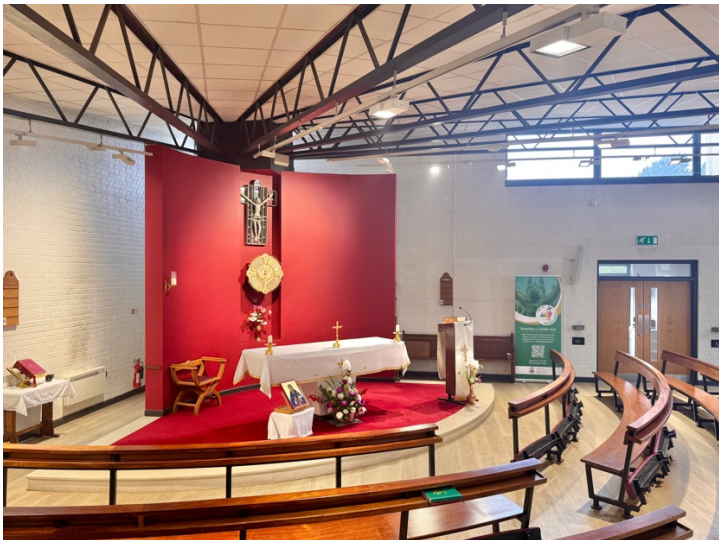
Welsh Martyrs, Penparcau.

The church at Penparcau is a modern, crescent shaped building, opened in 1970. It was fully refurbished in 2018 when it was rededicated. It had previously fallen into disuse and become derelict during a period of consternation, but attained a new lease of life following the closure of an older Church at the town center. At Aberaeron the church is over 160 years old and in good repair; it having formerly been used for worship by a different denomination, and temporarily as a dwelling. It was purchased for Catholic worship in 1957. It has been extended within living memory to provide extra space and toilet facilities. Both churches today have disabled toilet facilities, are well heated and are structurally sound. Neither church is listed.